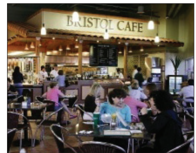
Event Host: Bristol Farms Cafe

Please Reserve by Tuesday August 19 th Limited Space Available